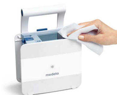
Hygienic and compact

Thopaz+ simplifies the daily management of chest drainage while providing enhanced operating features. The push button operation, color display screen and instructions provide intuitive operation and handling. In addition, the compact design supports contamination free handling, a simple cleaning process and convenient storage.