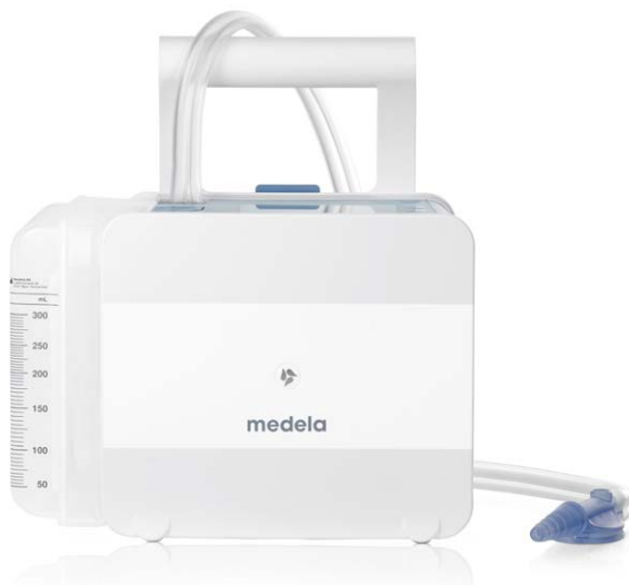
Cardiothoracic drainage system