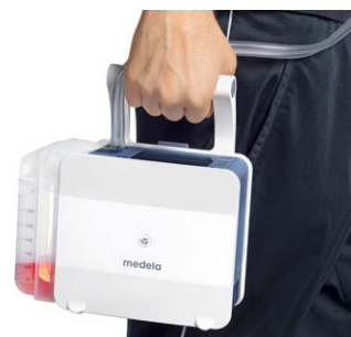
Early patient ambulation and mobility

The lightweight, compact design and rechargeable battery promotes early patient ambulation and mobility. The quiet operation as well as the automatic dimming display increases patient satisfaction while notifications provide additional patient safety and confidence.