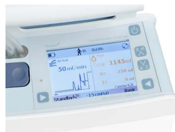
Objective data and precision

The continuous monitoring of air leaks, pressure and fluid levels permits the efficient and intelligent management of chest drains. These parameters are available in real time and show the last 72-hour trends on the Thopaz+ display screen. The therapeutic progress can be downloaded for assessment and for inclusion in a patient's medical record. Collectively, this data provides the objective clinical criteria needed for optimal chest tube management and removal decisions.